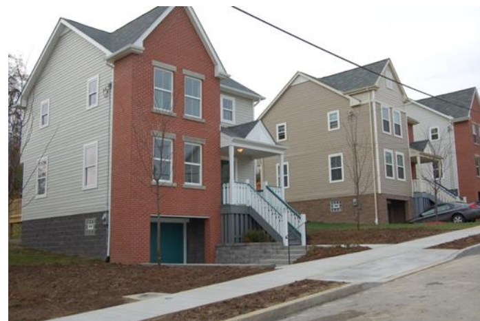
Bedford affordable for sale units in the Hill District.

200 Ross Street Pittsburgh, PA 15219 412-456-5000 www.hacp.org